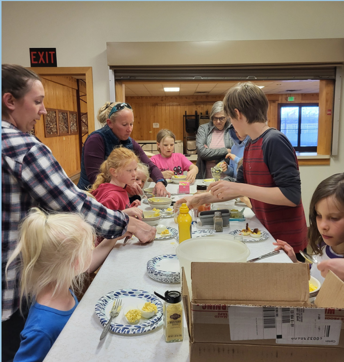
Grand County 4-H Cloverbuds making homemade mayo and deviled eggs. Yum!